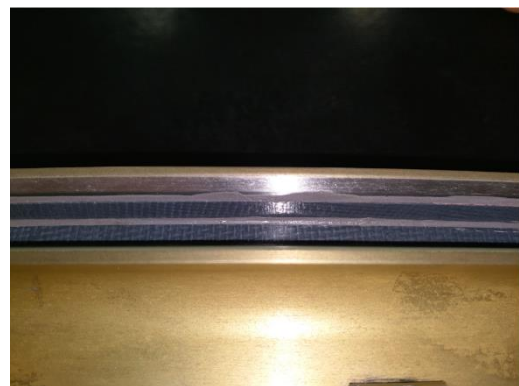
Repair 053: V-groove wear strip replacement

CONTACT US: sales@srtechnics.com | enginepartsrepair@srtechnics.com www.srtechnics.com | cpc.srtechnics.com